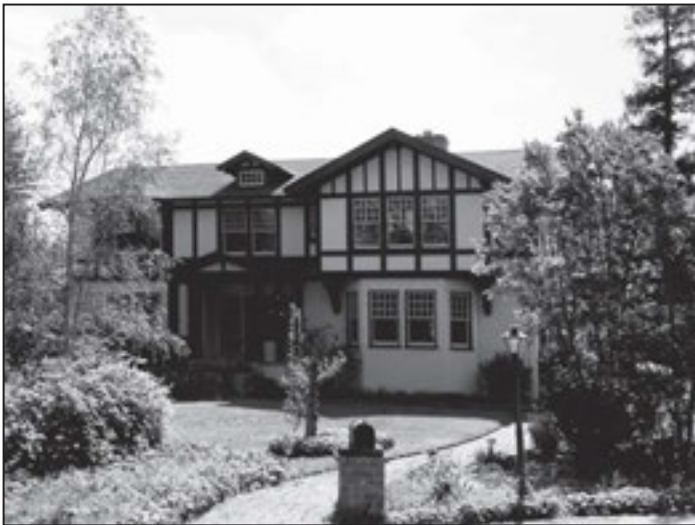
755 Santa Ynez Street, Stanford