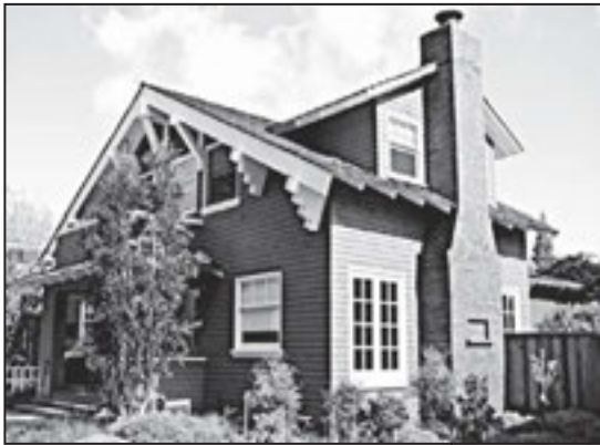
1345 Cowper Street

Lee has been honored three times with PAST Preservation awards, in 2010 for 1345 Cowper Street and in 2013 for the historic bakeries at 206–210 and 212–214 Homer Avenue.