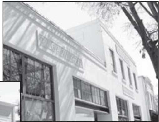
212–214 Homer Avenue