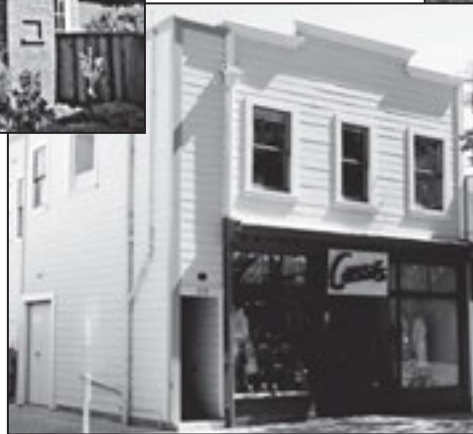
206–210 Homer Avenue