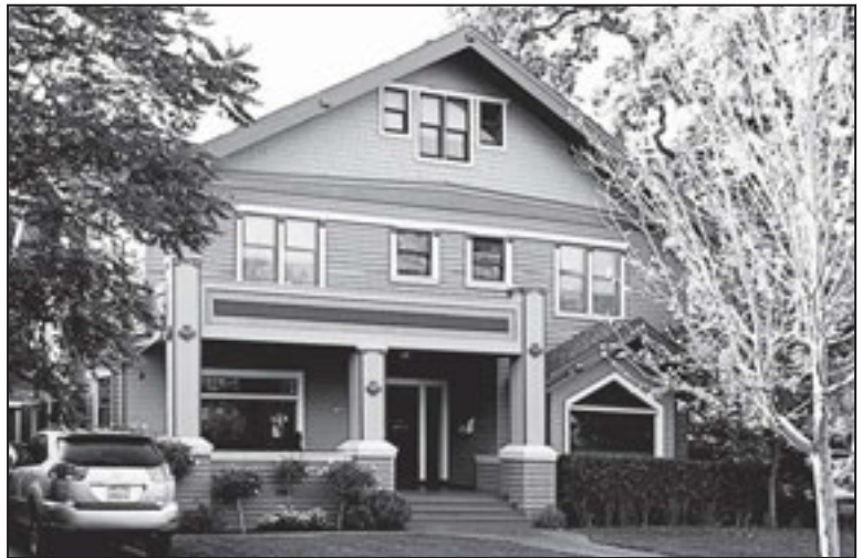
475 Melville Avenue — 1911