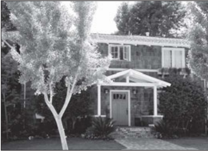
1040 Ramona Street