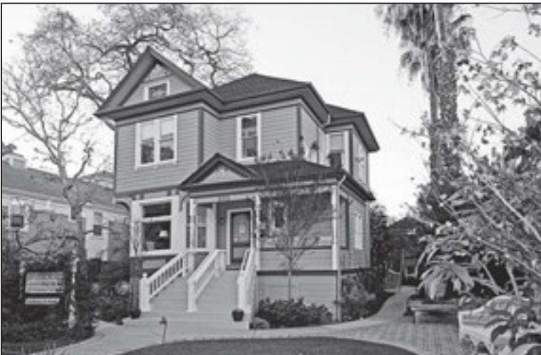
555 Lytton Avenue — 1896