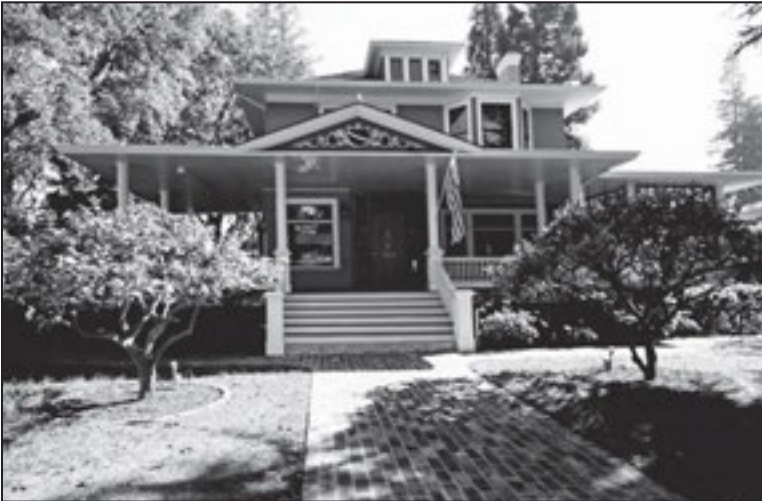
Peck-Wilson House, 860 University Avenue — 1906