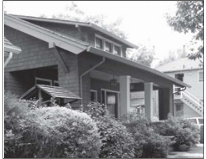
420 Homer Avenue