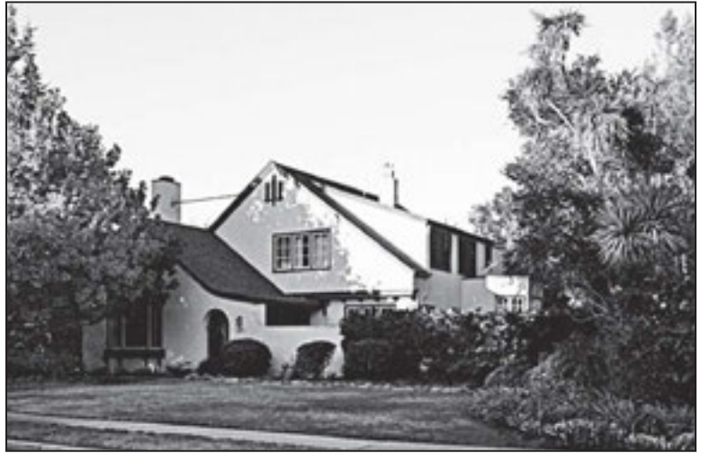
675 Alvarado Row, Stanford — 1925